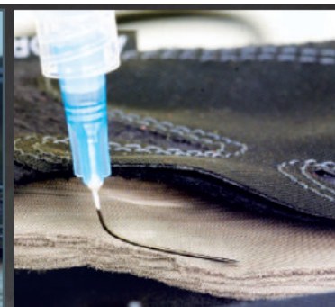
25 gauge needle failure