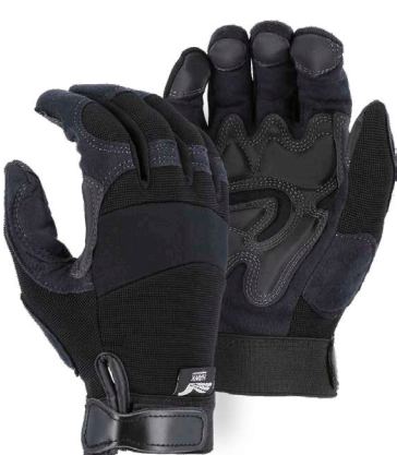
2139 Armor Skin™ Mechanics Glove with Reinforced Palm & Fingers