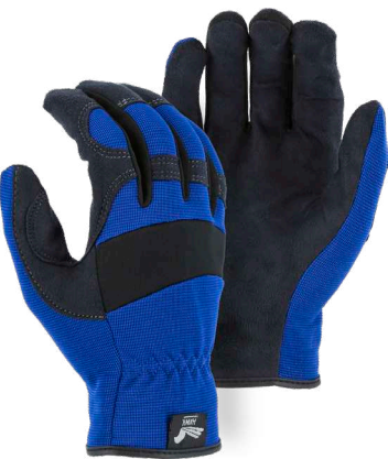
2136 Armor Skin™ Mechanics Glove with Slip-on Wrist