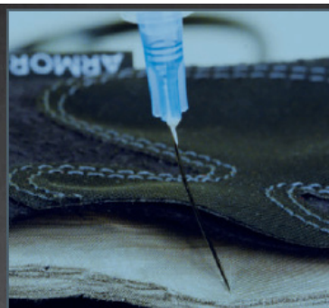
25 gauge needle buckling

In addition to the EN388 protocol for puncture resistance, Majestic intensifies the safety standard and measures a glove's puncture resistance according to the ASTM F2878 Standard by forcing a 25 gauge syringe needle through the material at a fixed speed. This measures the material's resistance to other puncture hazards commonly found in the workplace but not addressed by the EN388 standard.